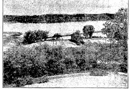
Boat House of the Club and View Over River