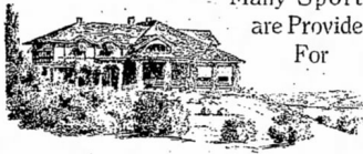
THE NEW CLUB HOUSE

Magnificent Location on Hills Above Mississippi Gives Builders Chance to Lay Out Most Beautiful Grounds in Middle West—Commodious Club House Is to Be Completed in July—Temporary Golf Course Open to Membership Memorial Day—Nearly All Memberships Are Now Taken—Many Sports are Provided For